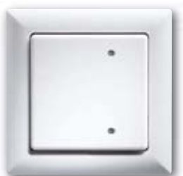
Bus pushbutton with rocker