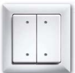
Bus pushbutton with double rocker