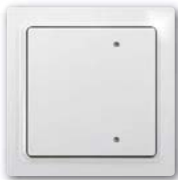
Bus pushbutton with rocker