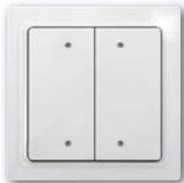
Bus flat pushbutton with double rocker