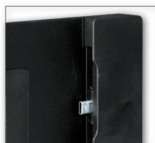
Front connection USB-C

Manuals and documents in further languages: http://eltako.com/redirect/InWall-10-sz