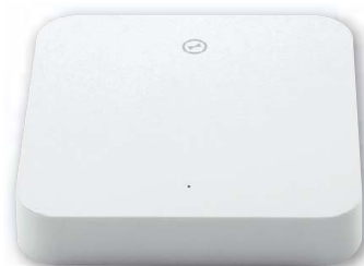
wibutler pro 2 Professional Smart Home controller