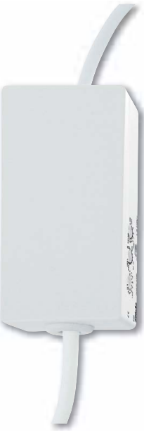
Function rotary switches on the side