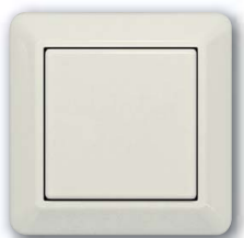
Wireless pushbutton with rocker (without frame)