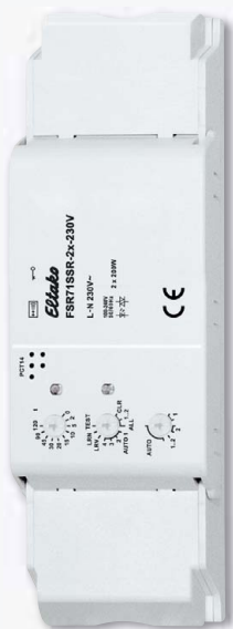
Function rotary switches