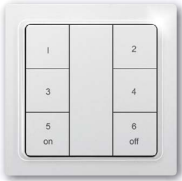
Keypad with laser engraving

Wireless 6-way pushbutton for single mounting 84x84x16 mm or mounting into the E-Design65 switching system. Silent and with battery (lifetime 5-8 years). Smart Home sensor.