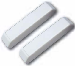
Reed relay and solenoid each 54 x 12 x 10 mm

The power supply of an extractor hood is connected by a window contact (NO if window open) so it can be switched on only if the window is open.