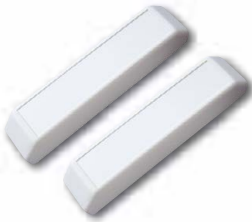
Reed relay and solenoid each 54 x 12 x 10 mm

The power supply of an extractor hood is connected by a window contact (NO if window open) so it can be switched on only if the window is open.