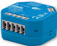
ESR64PF-IPM with adapter E0A64