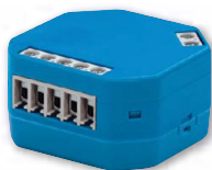
Series 64 with adapter EOA64