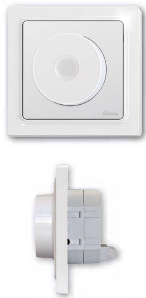
Function rotary switches