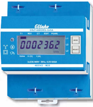
Typical connection 4-wire-connection 3x230/400 V