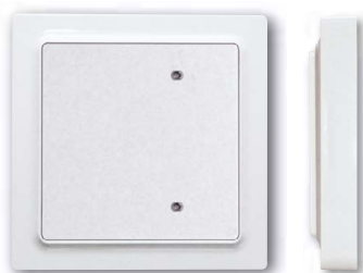
Bus pushbutton with rocker