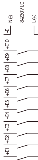
Control inputs FTS14EM

The second terminator which is included in the FST14KS has to be plugged to the last actuator.