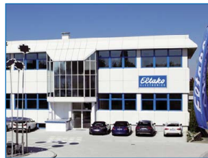
Distribution centre and head offices in Fellbach

In line with the importance that electronics have assumed in the company turnover, the Eltako logo was changed to include the internationally understandable word "ELECTRONICS". Although electromechanical switchgears are produced in high numbers, electronics cover more than 80 percent of total turnover.