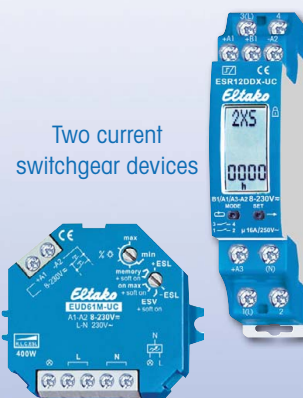
Two current switchgear devices