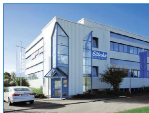
Central warehouse and electromechanics production in Lossburg